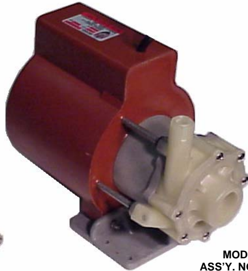
MODEL LC-5C-MD ASS'Y. NO. 0150-0004-0500