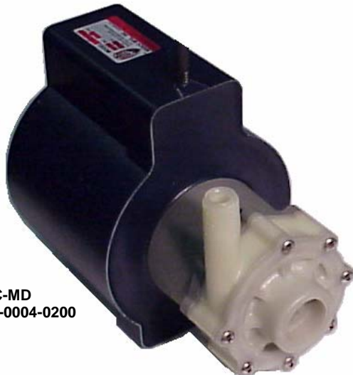
MODEL 5C-MD ASS'Y. NO. 0150-0004-0200