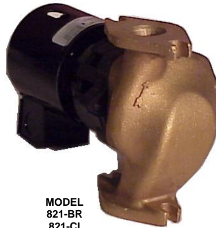
MODEL 821-BR 821-CI