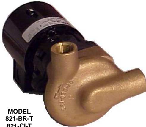
MODEL 821-BR-T 821-CI-T